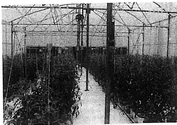
Fig. 3. High tech greenhouse for tomato production

Table 5 shows the specifications of four types of medium and high tech greenhouses. Quality potato seeds are produced in BARI Seed Breeder Production Centre, Debijang, Panchagarh. This greenhouse is made of plastic net. The greenhouse is Quonset type greenhouse. The structure is made of G.I pipe. The length, width and height of this greenhouse are 147.6 ft, 16.4ft and 7ft respectively. It has only one door. The dimension of the door is 4.92ft×4.92ft. In north Bengal 35,000 ha potato land area are being contaminated by late blight during winter. For this reason, BARI Seed Breeder Production Centre is using net cover greenhouses in winter for the purpose of protecting the potato seed from late blight and fog. Construction cost of this type of greenhouse is near about one lack taka.