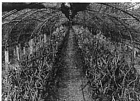
Fig. 2. Orchid cultivation in greenhouse (Guptargaon, Phulpur, Mymensingh)