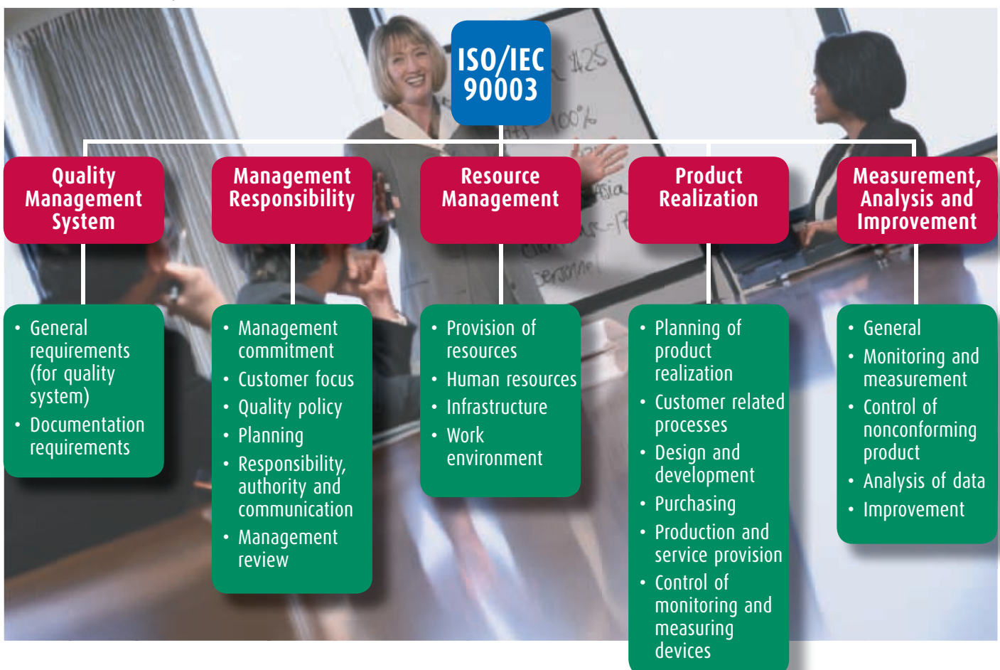
Figure 1: The structure of ISO/IEC 90003

A first glance at the structure of the standard ( Figure 1 ) demonstrates the comprehensiveness of the five perspectives from which the application of quality in software engineering is addressed.