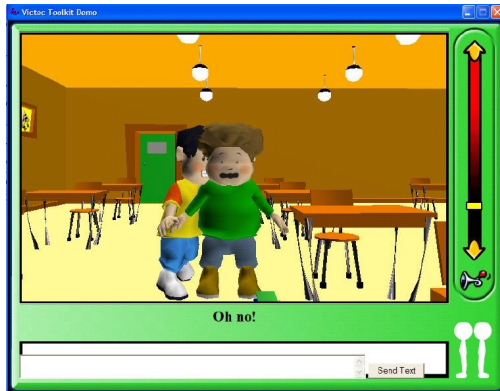
Figure 1. A first prototype of the FearNot! demonstrator

acter, discussing the problems that arise and proposing coping strategies. Note that in bullying situations there are quite clear identifiable roles: the bully , the victim , bully-victim (a child that is sometimes victim and sometimes bully) and by-stander.