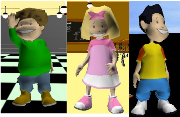
Figure 3. Three of the characters developed for the FearNot! application (John, the victim, Martinha, the neutral and Luke, the bully)

the characters were evaluated by the children from their creation. Also, we designed the characters and the situations for the age groups we are targeting. We are now designing characters with uniforms for the UK schools to make characters closer to the children and allow children to identify with them. We also have considered specific situations for both genders (more direct bullying for boys and relational bullying for girls). Finally, we used very popular characters from a Portuguese children's web portal (Cidade da Malta in http://www.cidadedamalta.pt/ ), originally in 2D and converted to 3D for the project.