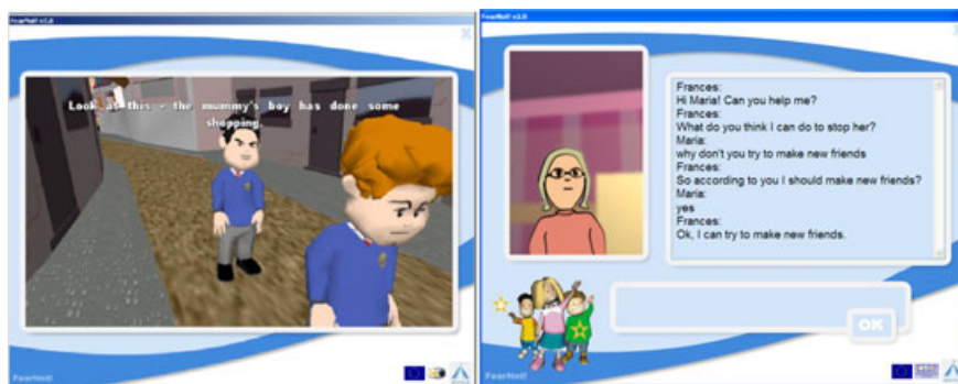
Figure 1 FearNot! screenshots of male verbal bullying episode and female making new friend user interaction episode (English version)