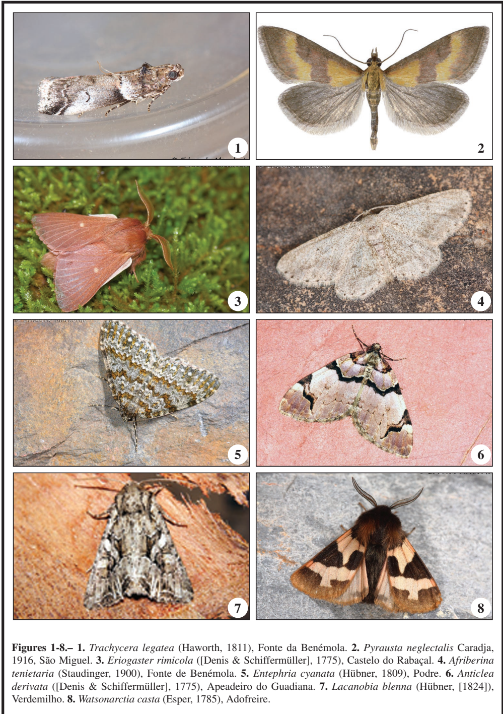
Figures 1-8. – 1. Trachycera legatea (Haworth, 1811), Fonte da Benémola. 2. Pyrausta neglectalis Caradja, 1916, São Miguel. 3. Eriogaster rimicola ([Denis & Schiffermüller], 1775), Castelo do Rabaçal. 4. Afriberina tenietaria (Staudinger, 1900), Fonte de Benémola. 5. Entephria cyanata (Hübner, 1809), Podre. 6. Anticlea derivata ([Denis & Schiffermüller], 1775), Apeadeiro do Guadiana. 7. Lacanobia blenna (Hübner, [1824]), Verdemilho. 8. Watsonarctia casta (Esper, 1785), Adofreire.